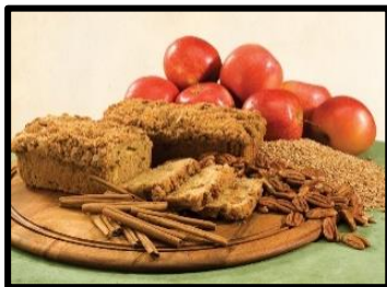
APPLE CRUMB TEA CAKE & MUFFINS

Indicated day is when the breads are baked. We carry all our breads over one day. Each day loaves are hot out of the oven between 7 and 10. Bread needs about 2 hours before slicing.